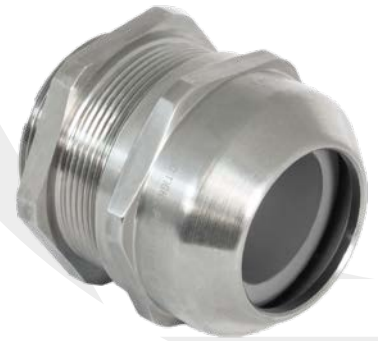
shown with standard seal